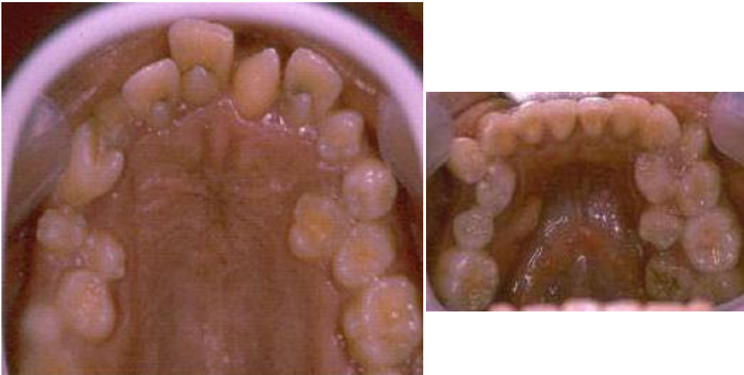
Fig. 1 and 2. Thirteen erupted supernumerary teeth.